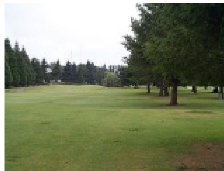
3 rd Hole, North Shore Golf Course

1:00 PM to 7:00 PM Pre-registration opens at the Convention Center. A name tag will be required to gain admittance to any pre-convention event and to the convention itself.