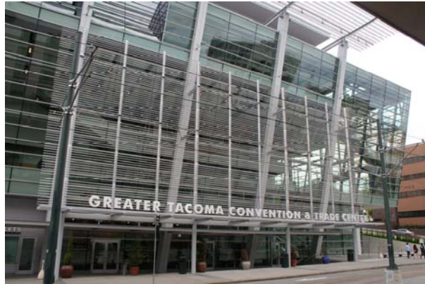
Greater Tacoma Convention and Trade Center

One of the Largest Affordable Housing Management Conventions in the United States