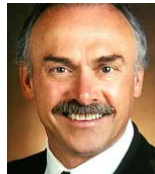
Keynote Speaker – Football Great, Rocky Bleier Vietnam War Veteran and 4-Time Super Bowl Champion – with the Pittsburgh Steelers