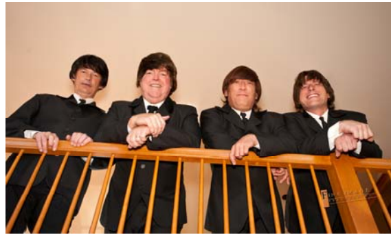
British Invasion! The Beatles tribute band MEET REVOLVER is our evening banquet entertainment