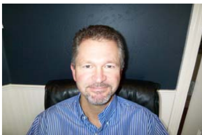
Curt Gaschler USDA/Rural Development