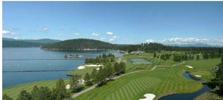
The Beautiful Coeur d’ Alene Resort (Left) and Coeur d’Alene Golf Club (Right) Coeur d’Alene, Idaho